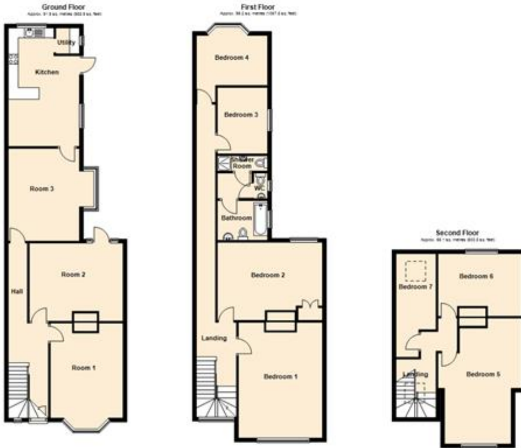
Total area: approx. 247.2 sq. metres (2660.5 sq. feet)